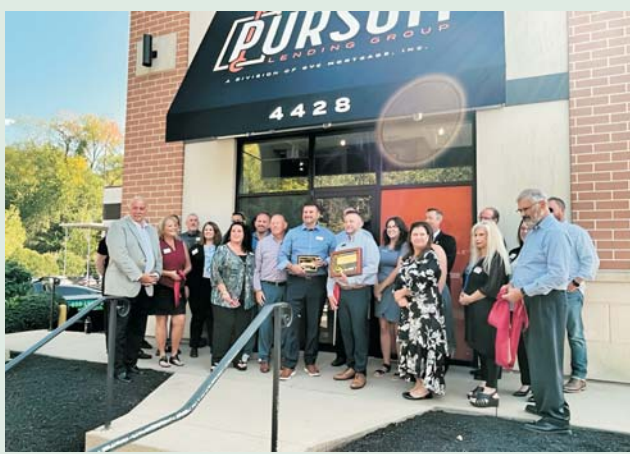
Pursuant Lending Group 4428 Whipple Ave NW Canton