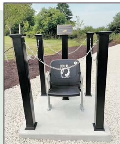
POW/MIA Honor Chair

The third donation and piece are three flag poles in the honor garden. The flags adorning the garden are the POW/MIA flag, the Purple Heart Flag, and the Service Branch flag representing all six branches of our Armed Services. The poles and flags were donated and installed by the Plain Township Fire Department in the continued effort to recognize all of America's service members and their sacrifices.