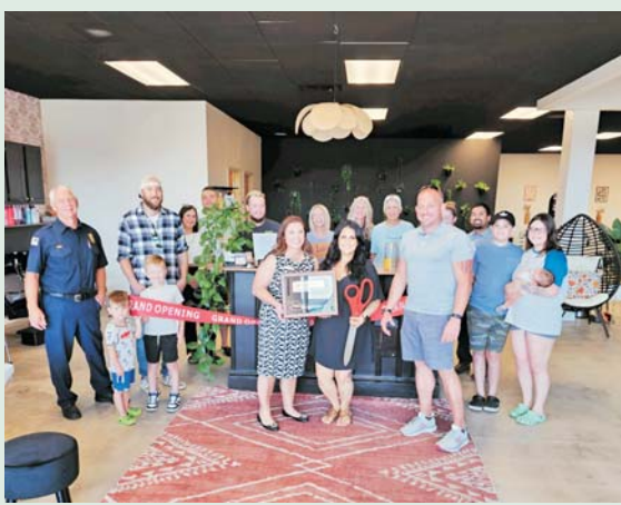
East & Co. Salon 3143 Whitewood St NW North Canton