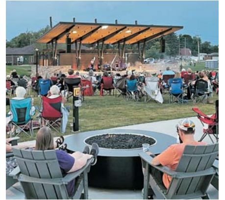
Parks Dept. news continued on next page