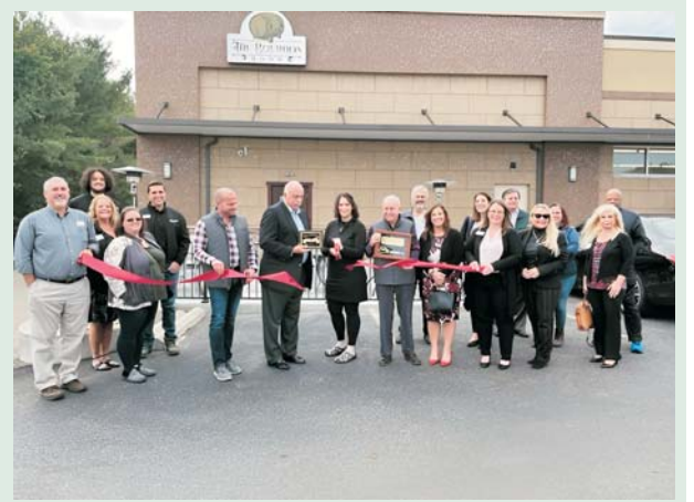
The Bourbon Room 2710 Easton St NE Suite D Canton

We also celebrated the grand opening of the new addition to Grace Baptist Church located at 5050 Middlebranch Ave NE!